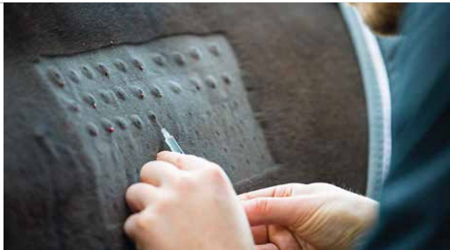
Intradermal allergy testing is the gold standard for identifying respiratory and skin allergies.

A newer prescription drug, Apoquel (oclacitinib) has recently hit the market and might prove useful for allergic horses. "Even though the drug is currently labeled for use in dogs (with allergic dermatitis), initial studies show that horses absorb it well," Fultz says. The drug targets pro-inflammatory proteins, called cytokines, responsible for itching and inflammation,